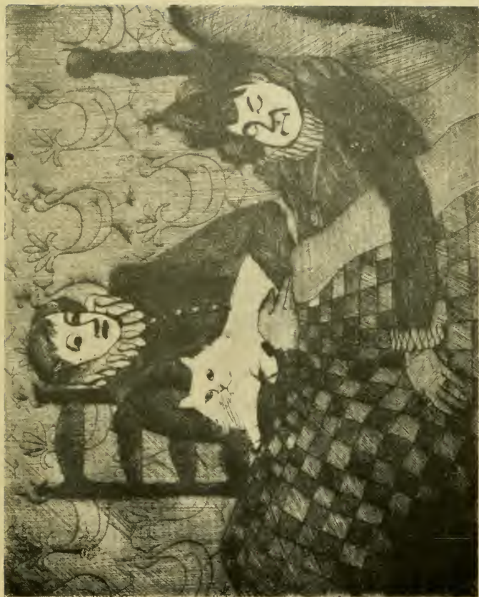
"LAY BACK AND SHUT HIS EYES WEARILY"